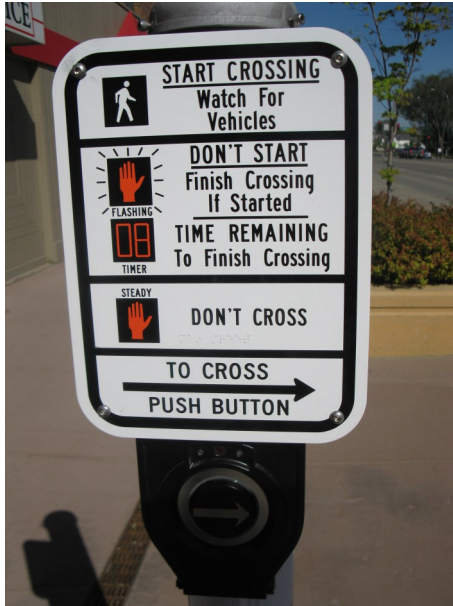
Picture of pedestrian crossing signage

For the last decade or so, SWCIL has been performing annual pedestrian accessibility assessments of Marshall's main intersections (there are currently sixteen), sidewalks, and bike paths. This involves assessing the condition of any related signage, pedestrian ramps (i.e. curb cuts), and the working condition of the buttons and audio/visual signals that aid safe crossing of the street.