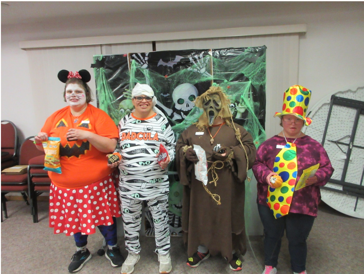
Monster Mash Bash participants in Halloween costumes

The Monster Mash Bash that was held October 28 th at St. Stephen's Church was a success! We had several participants in the costume contest with several categories that everyone voted on. People were busy showing their moves on the dance floor, visiting with friends, enjoying snacks, coloring some Halloween pictures, taking pictures by the photo booth, and trying out a new craft. It was great to be able to be in-person and indoors!