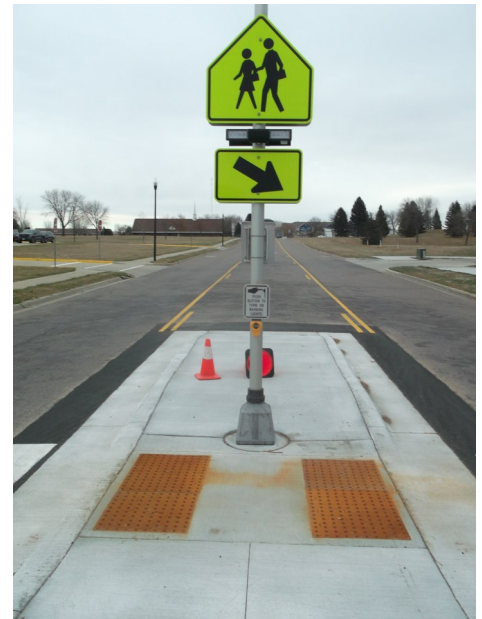
Picture of pedestrian refuge islands and rapid flashing beacon signage