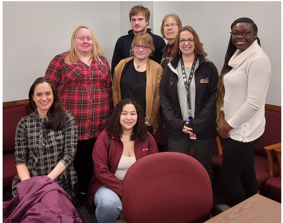
SWCIL staff and consumers with Rep. Fogelman