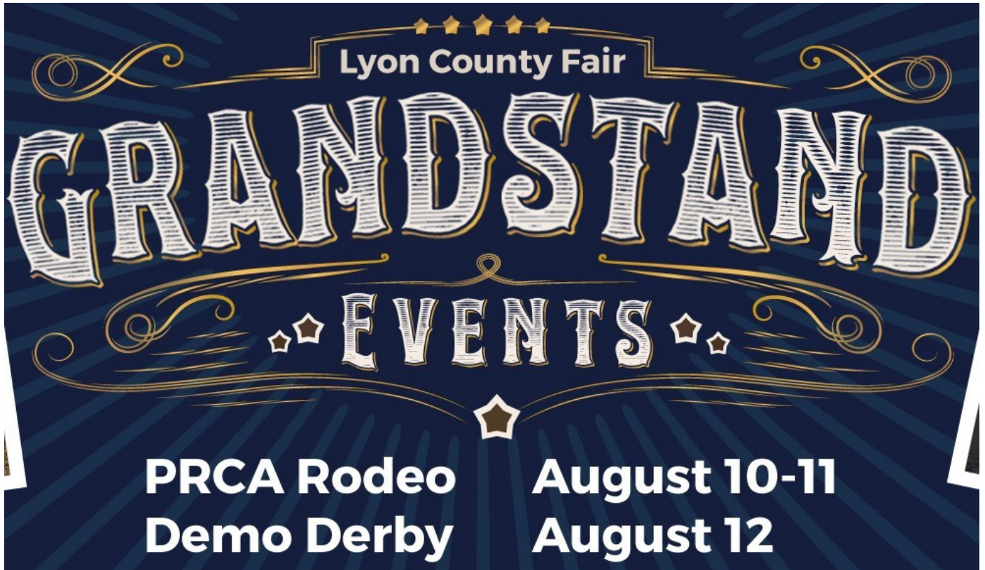
Lyon County Fair sign

If you plan on attending the Lyon County Fair this year (Aug. 9-13), we hope you will plan on stopping by our SWCIL disability awareness booth, which will be open Wednesday, Thursday, and Friday (Aug. 9-11).