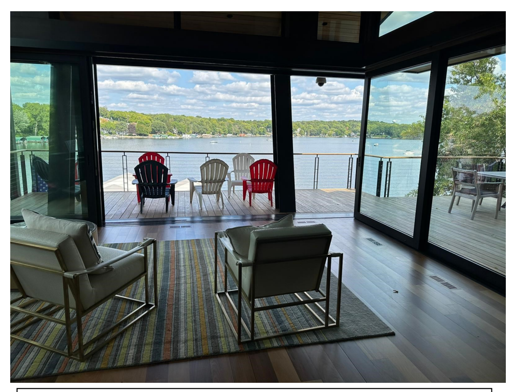
Living room/deck of house on Lake Minnetonka