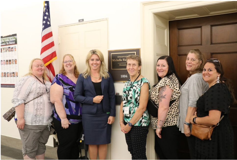
SWCIL staff and others at US Capitol

As it does every year, the National Council for Independent Living once again held its national conference in Washington, D.C., in July, 2023. This year SWCIL sent eight of its staff and one member of its board to be a part of this experience.