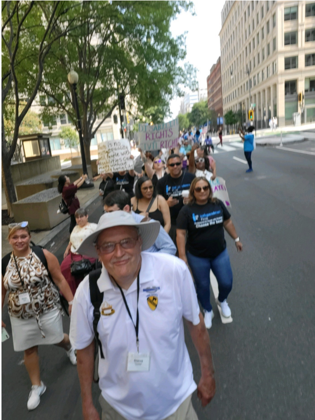
SWCIL staff marching

The group from SWCIL also participated in a march to the US Capitol that included more than 700 people. The purpose of this event was to promote integration into community settings, as well as advocating for disability rights, including freedom from institutionalization.