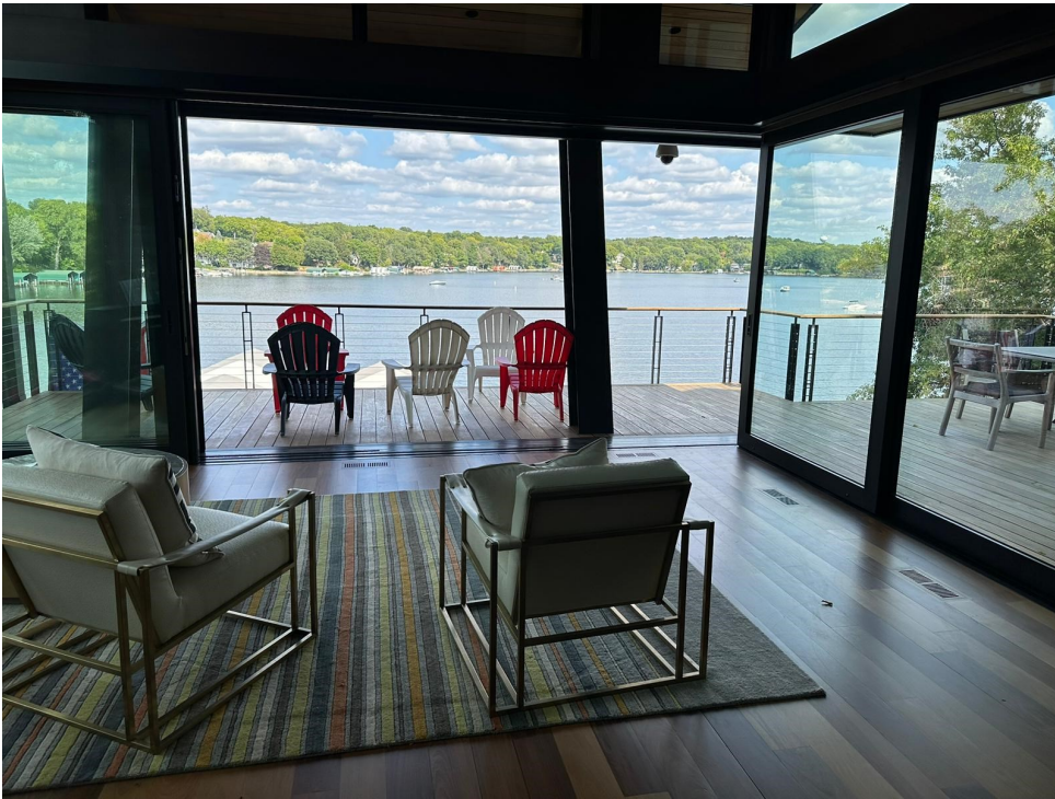
Living room/deck of house on Lake Minnetonka