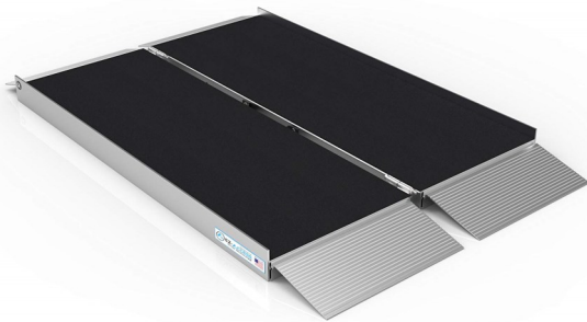
Example of SWCIL suitcase ramp

The summer of 2023 was another great one for me, especially getting out in the nice weather nearly every day and enjoying activities with family and friends. But the daytrip I took with a high school friend of mine to his rental place on Lake Minnetonka proved to be the surprise highlight of the year.